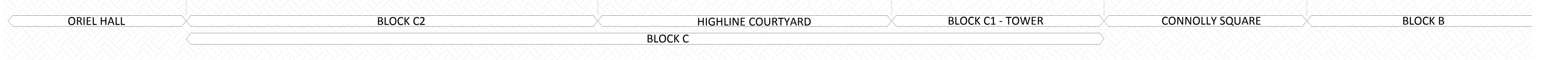
01 BLOCK C - SECTION 01 1 : 200